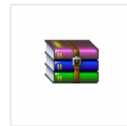
UBS Gst A4 Format

Download the attachment and Extract to your computer! For Example, Extract to C:\Gst Format\